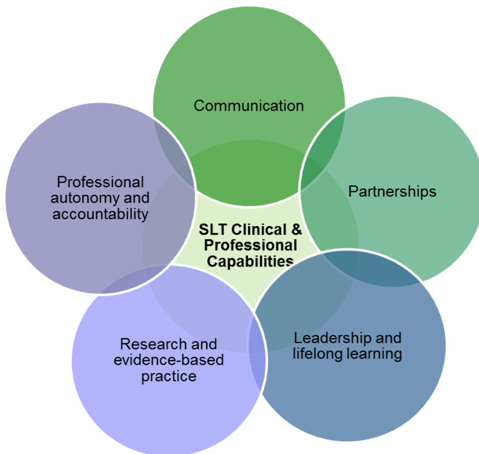
Figure 1. The RCSLT five core capabilities

Each core capability represents a particular strength that SLTs bring to the services that they provide. These core capabilities act as a guide from the start of becoming an SLT, through to the newly qualified period and as an ongoing reference point for shaping the lifelong learning of the speech and language therapy practitioner as part of their CPD. The capabilities act as an adaptable professional tool from which to embrace the challenges of rapidly changing professional contexts.