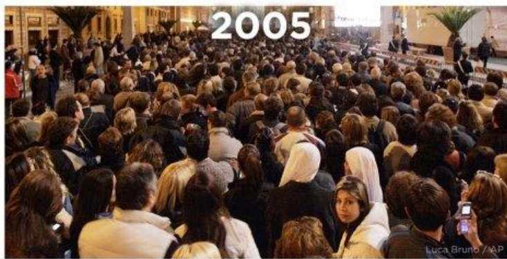
Pope Benedict XVI