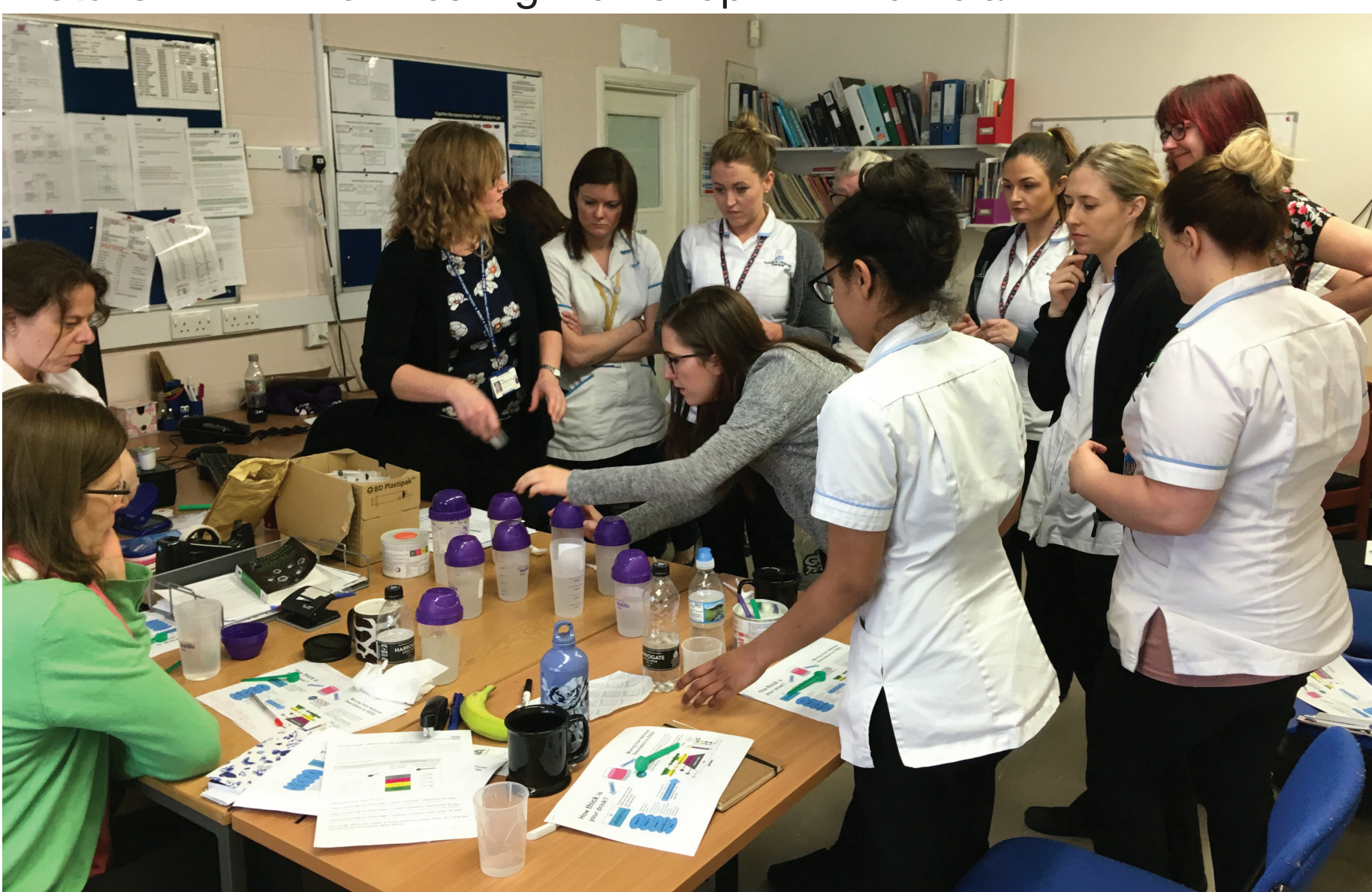
Picture 1: HEY flow testing workshop with Nutricia