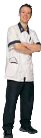
Edwin Poots, MLA Minister of Health, Social Services and Public Safety

I am confident that through positive partnerships we can all maximise outcomes for patients and their carers using AHP resources to enhance people's lives and deliver services that are safe, timely, effective and focused on the needs of the population.